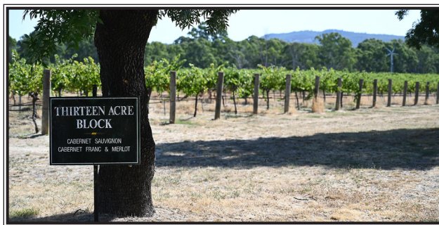
Image: 13 Acre Block at Best’s Great Western

“Delivers a nuanced interpretation of the grape, proving once again that cabernet is right at home in the Grampians. Briar, bush mint, bay leaf, bracken and earth here, a dollop of vanillin oak and concentrated black fruits there, with taut tannins laying the groundwork for a long, brilliant future.”